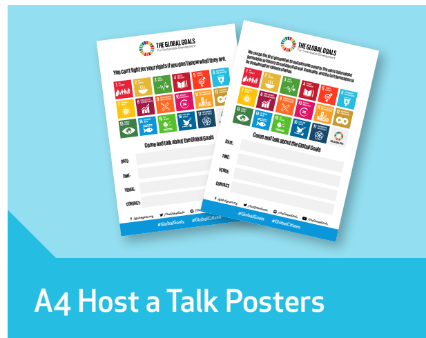
A4 Host a Talk Posters

The Global Goals get people talking. So we've made a simple guide to help those who want to engage their organisation in short talks about the Global Goals. Host a session at lunch times, tea times or during launch week.